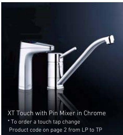
XT Touch with Pin Mixer in Chrome

* To order a touch tap change Product code on page 2 from LP to TP