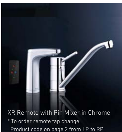
XR Remote with Pin Mixer in Chrome

* To order a touch tap change Product code on page 2 from LP to TP