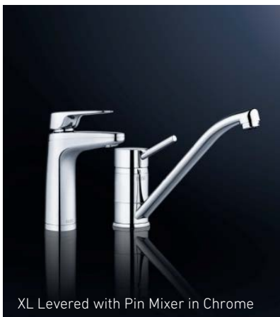
XL Levered with Pin Mixer in Chrome